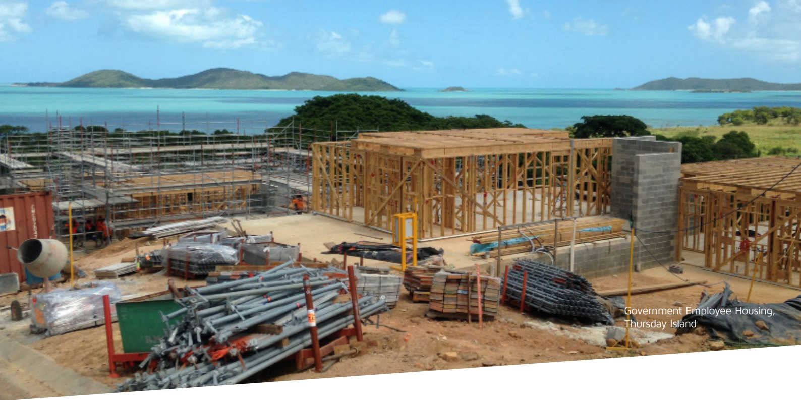
Government Employee Housing, Thursday Island