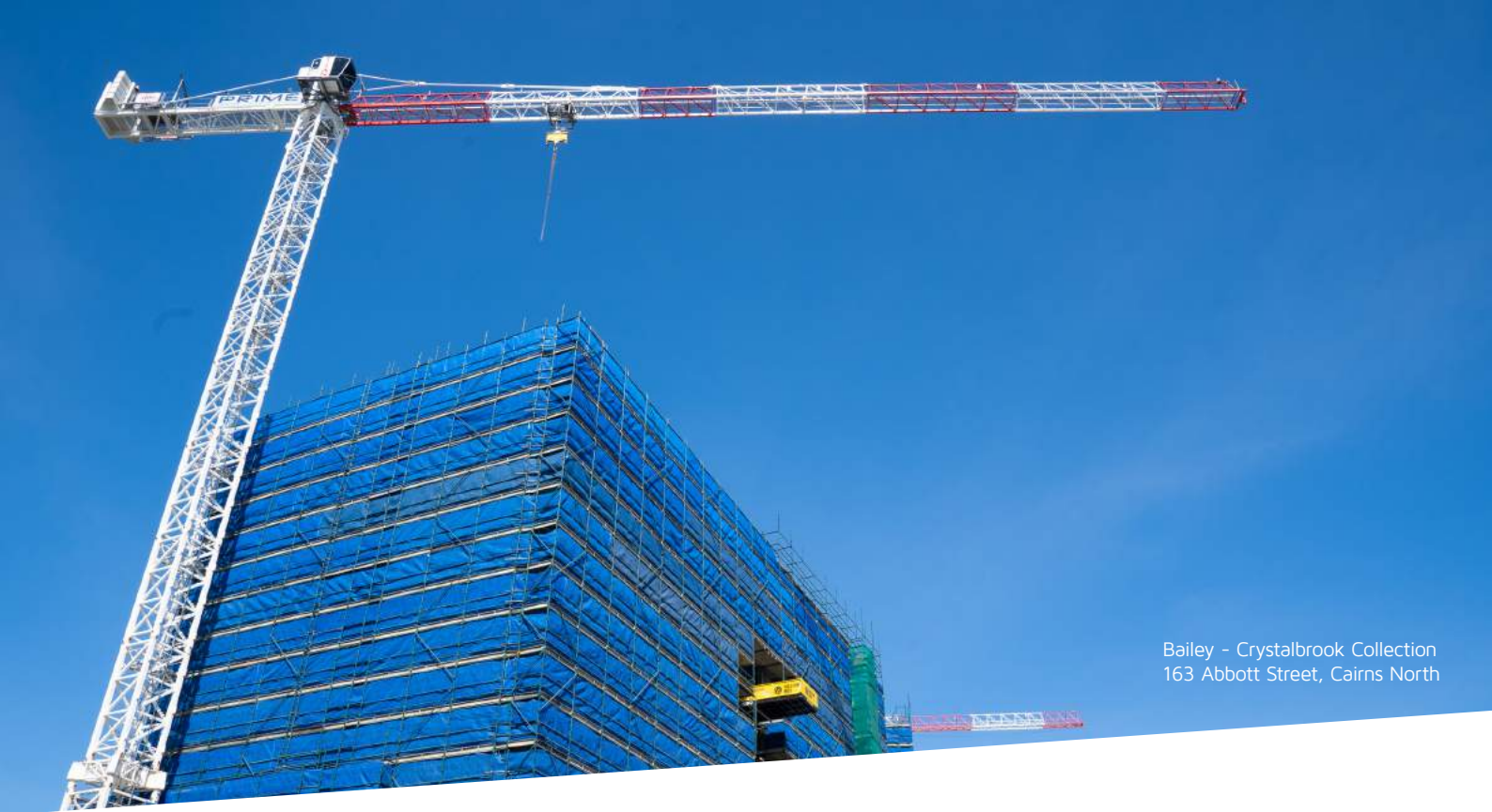
Bailey - Crystalbrook Collection 163 Abbott Street, Cairns North